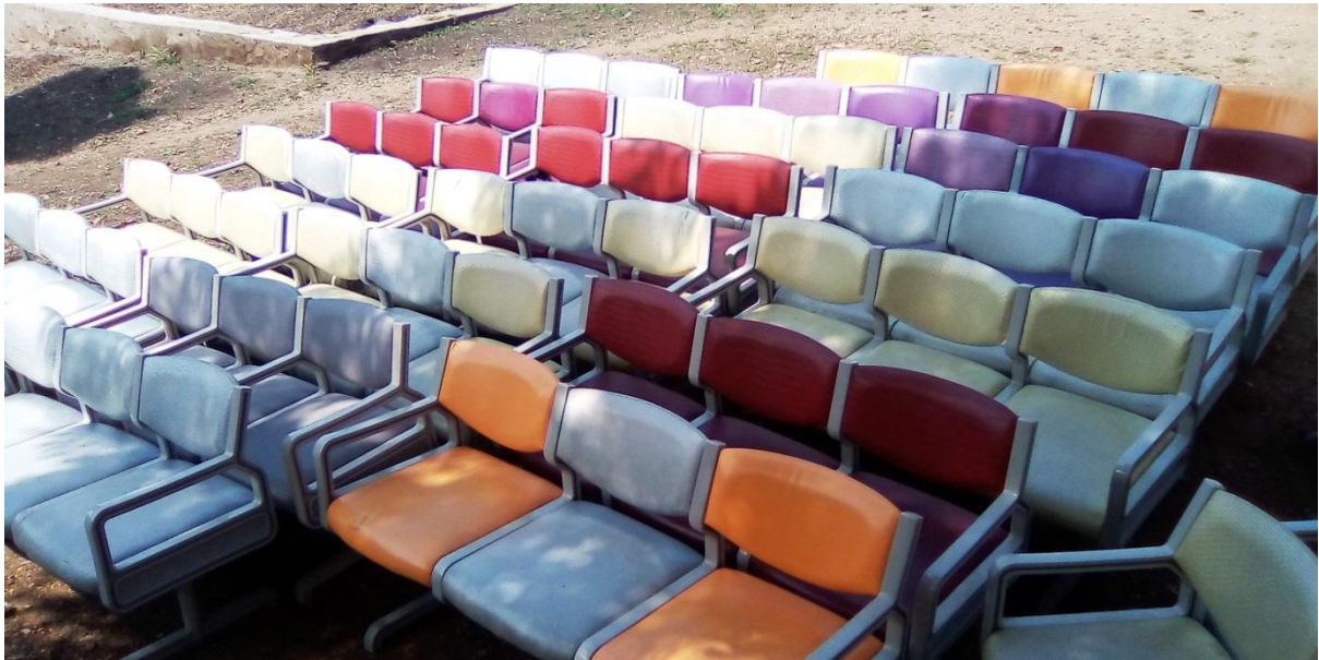
Waiting room chairs donated by the Women's and Children's Hospital