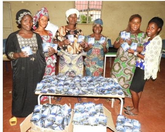
Women have assembled birthing kits

The collaboration with the Birthing Kit Foundation continues since 2005 with the in-country production of 10,000 birthing kits. We thank the Neilson Foundation for funding this project. It is cheaper, quicker, more efficient and leaves a smaller carbon footprint to have birthing kits made locally. There is a small stipend paid to the women for the kits they make which the women can use to start microcredit programs. It builds self-sufficiency in the community.