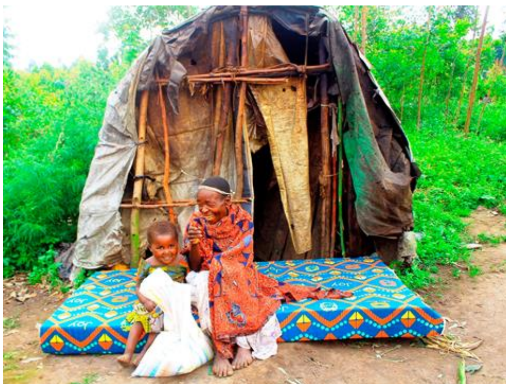
Mattresses delivered to Pygmies displaced by the Nyingongo volcano eruption