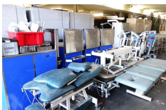
Medearth volunteers in Sydney packed this container