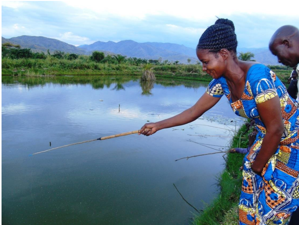
Village of Sange microcredit fishing ponds