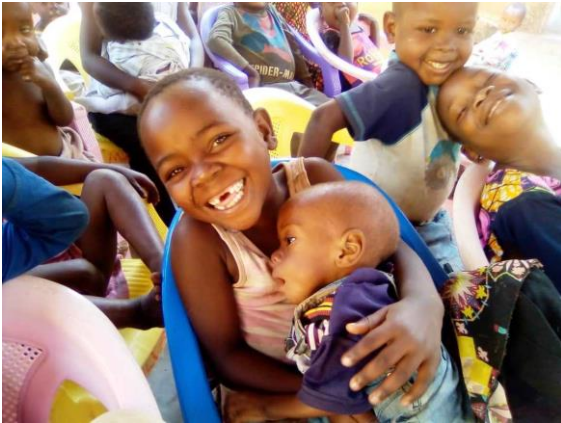
Orphans are happy

insecurity. The MHCD Orphanage was opened for these 39 children and 11 widows. They are housed, cared for, fed and receive free medical care.