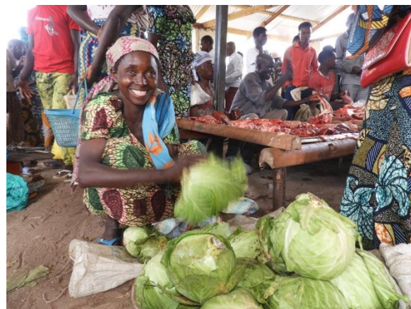
A roof meant market days were not weather dependent

We upgraded our website with the probono help of Dave and Suzanne Green from EnvyUs web designers. As expected it was a huge amount of work, looks amazing and is much valued and appreciated. Please visit www.mhcdasa.org.au to read about our work.